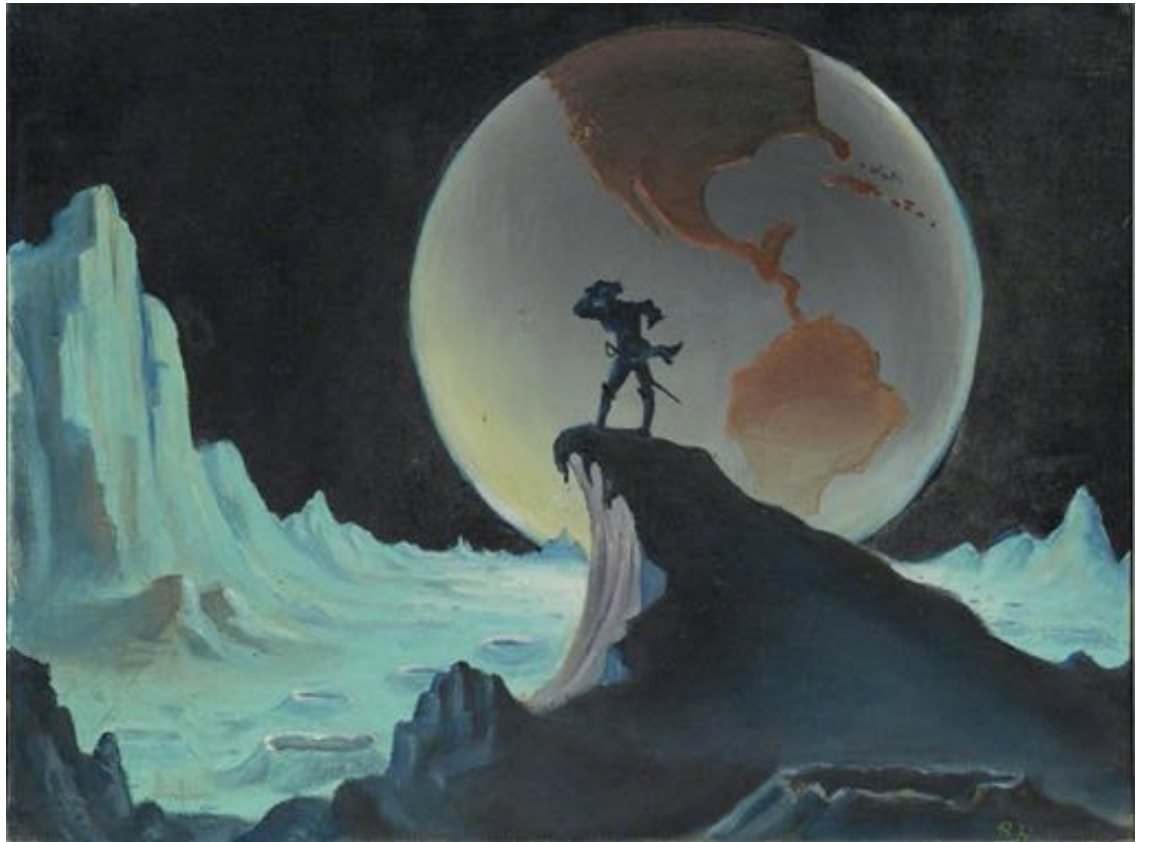
“Baron Munchausen Arrives on the Moon” by Ray Harryhausen, 1948