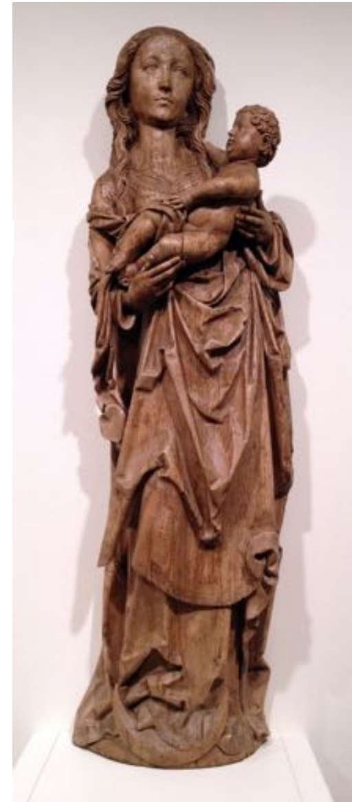
"Virgin and Child on the Crescent Moon" by Tilman Riemenschneider, c. 1521-1522