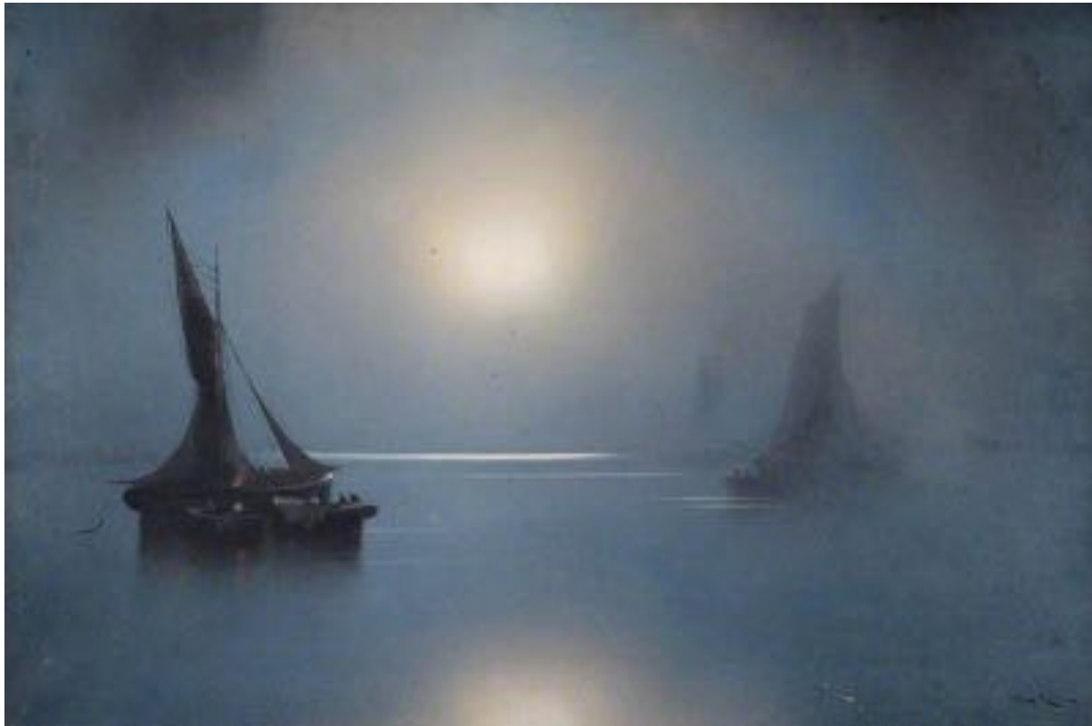
“Moonlight” by Joachim Hirschl-Minerbi, 1880