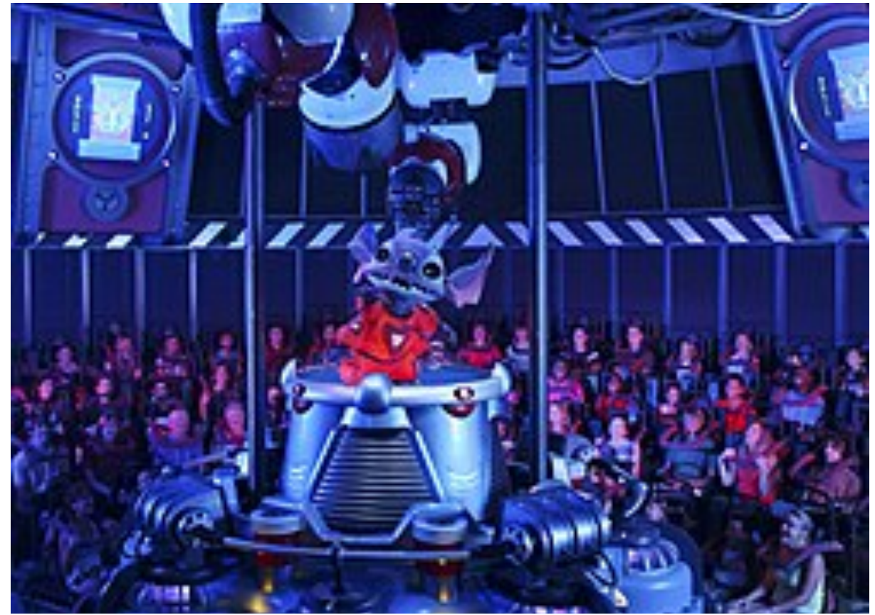
Stitch's Great Escape, 2004