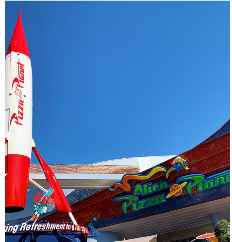
Alien Pizza Planet, 2018