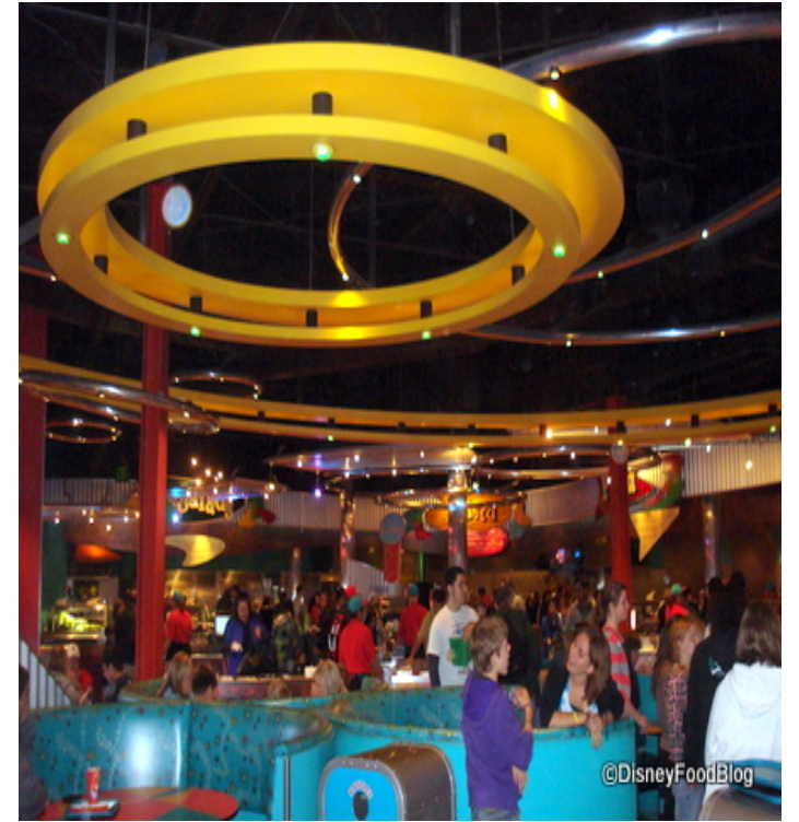
Redd's Rockett Pizza Port, 1998